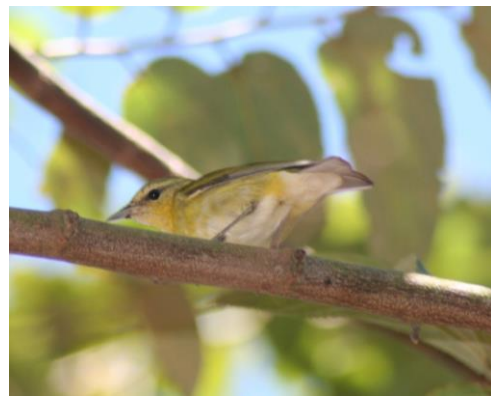
Migratory Tennessee Warbler

Leguminous trees (Fabaceae) fertilize soil with nitrogen, provide lumber and fuelwood and attract birds for pest control—a win-win for farmers.