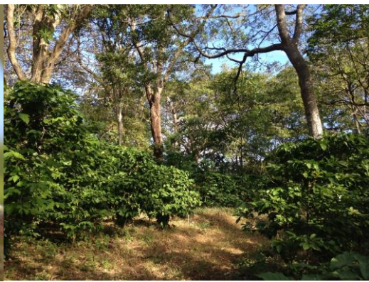
Shade-coffee farm in Nicaragua