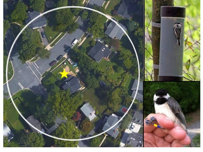
Figure 1. Clockwise from top left: example residential neighborhood study site; Carolina chickadee nest building in a nest box; color-banded chickadee.

Community science (also called "citizen science") is an ideal opportunity to use natural history to learn about urban biodiversity and encourage the public to intimately engage with the natural world (Bonney et al. 2009, Hansen et al. 2018). This became apparent during my dissertation research when I worked on a project called